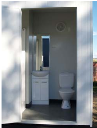
Inside: Vanity, Mirror, Toilet