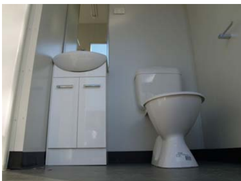
Inside : Heavy Duty Vinyl Flooring