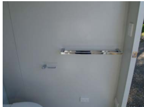
Quality Fittings : Double Towel Rail, Toilet Paper Holder