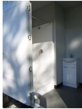
Inside: Shower Cubicle and Vanity