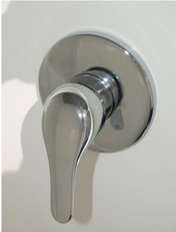
Quality fittings : Shower Mixer