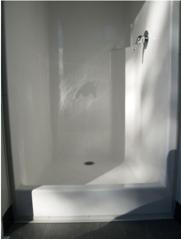
Inside : Full Size Moulded Shower