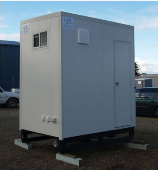
Portable Bathroom : Rear View