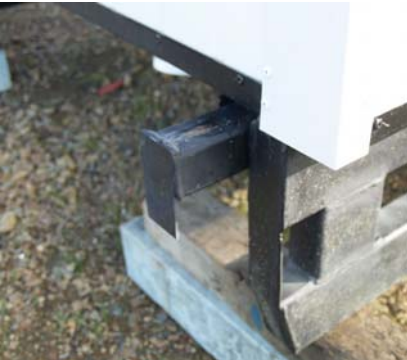
Crane Lifting Hooks