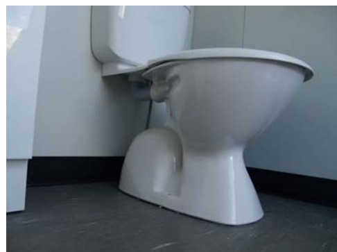
Inside : Concealed Plumbing and Electrical Cabling