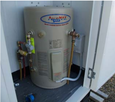
50 litre Electric Hot Water