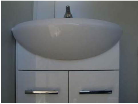
Quality Fittings : Semi-Recessed Vanity Basin with Overflow and Pop-Up Plug