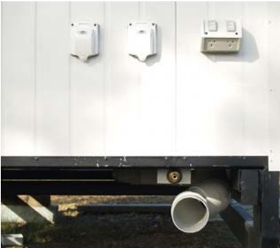
Power, Water and Sewerage Connections