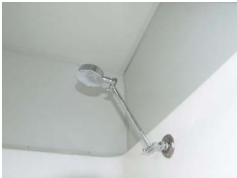
Quality Fittings : Full Size Shower Head